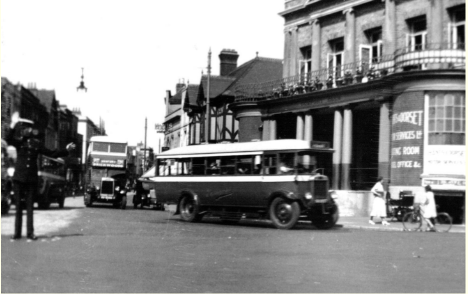
The following month, October 1934, saw the arrival of eight 1926 Leyland Lions from the Hants & Dorset fleet. No 8 (TR 2837), is seen here approaching Gosport Ferry with a H&D Leyland TD1 following behind.