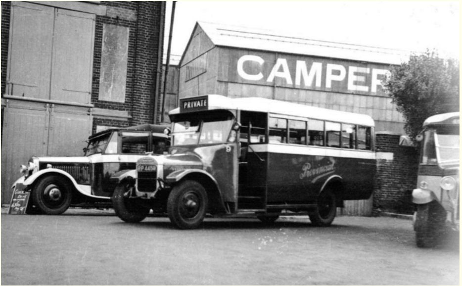
A further second-hand acquisition in 1934 was no.9 (RP 4459), a 1927 Thornycroft A2, which arrived from Nutt of Harpole. Bodywork was by York, Ward and Rollatt.