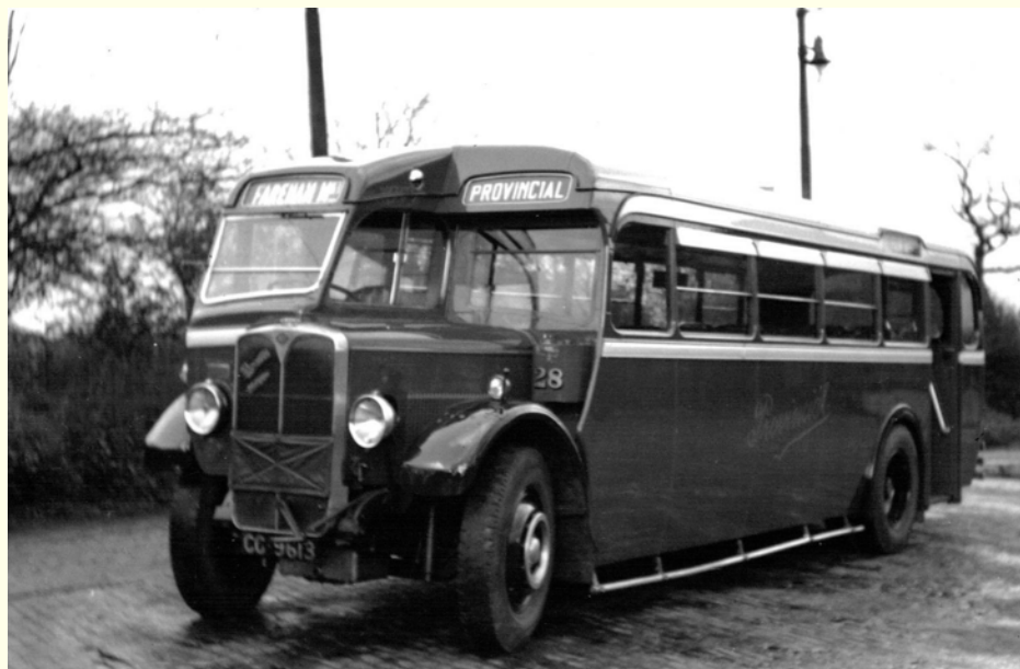
The 8 AEC Regal 4s gave remarkable service to Provincial. No.28(CG 9613), at Hoeford when fairly new, survived until 1968.