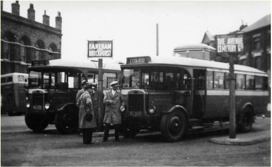
A classic view of Gosport Bus Station illustrating 32 (VW 6428) and number 1 (RU 3154), a former Hants & Dorset example.