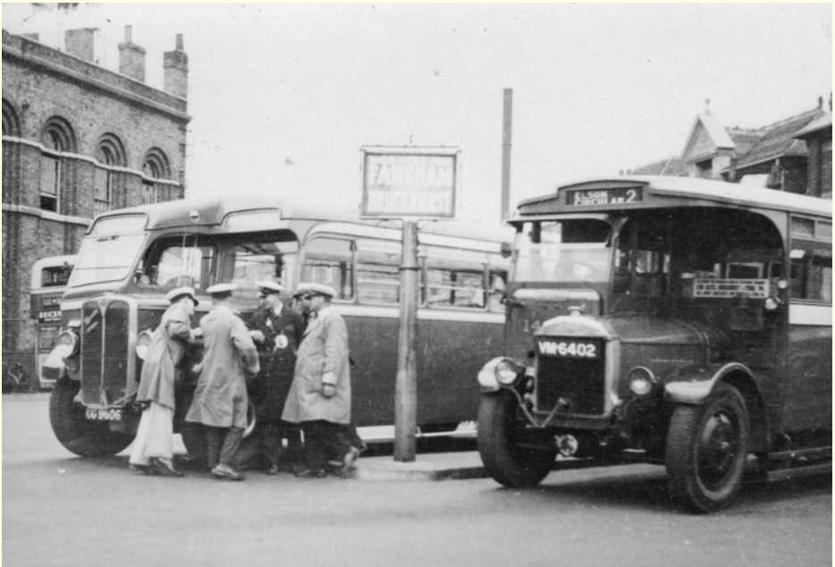
Standing next to Regal 23 is 14(VM 6402) a 1929 Dennis 'E' with Davidson body which had seen service with both Manchester and Luton Corporations before being acquired by Provincial in 1934.