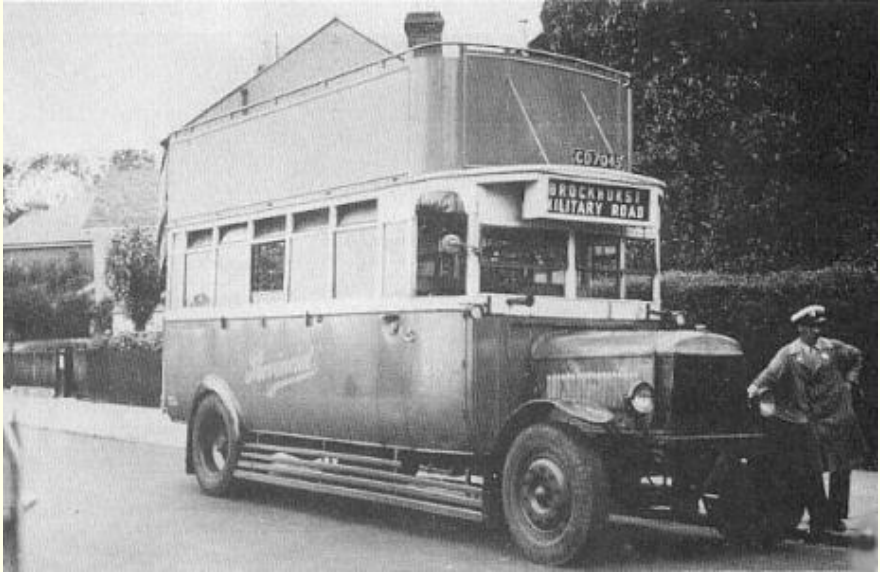
The famous ex Southdown Leyland G7 CD 7045, which was kept by Provincial for many years and known as 'Old Bill'. It is now preserved in Southdown livery.