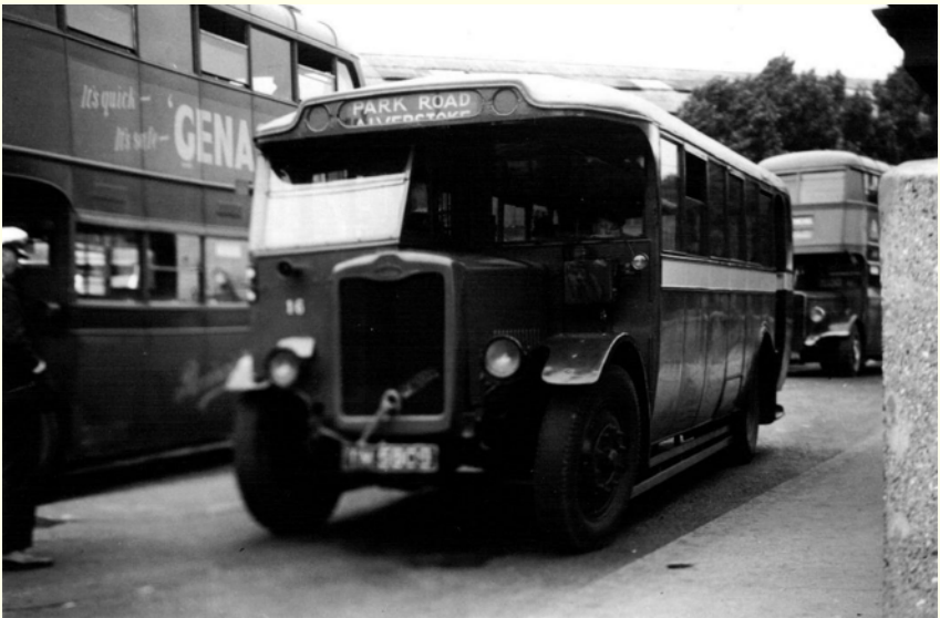
Another Dennis acquired in 1934 was 16(TM 5909), a 1929 'EV' with Strachans bodywork, which remained in service until the early 1950s. After a few years as a stores vehicle at Hoeford, it was damaged beyond repair in the 1957 fire.