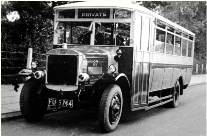
Between 1908 and 1936 there were many interchanges of vehicles between the Provincial Grimsby and Gosport fleets, including this handsome 1926 Guy BB with Guy B28F body. Seen here as Grimsby 37, it spent January–November 1930 as fleet no.28 whilst at Gosport.