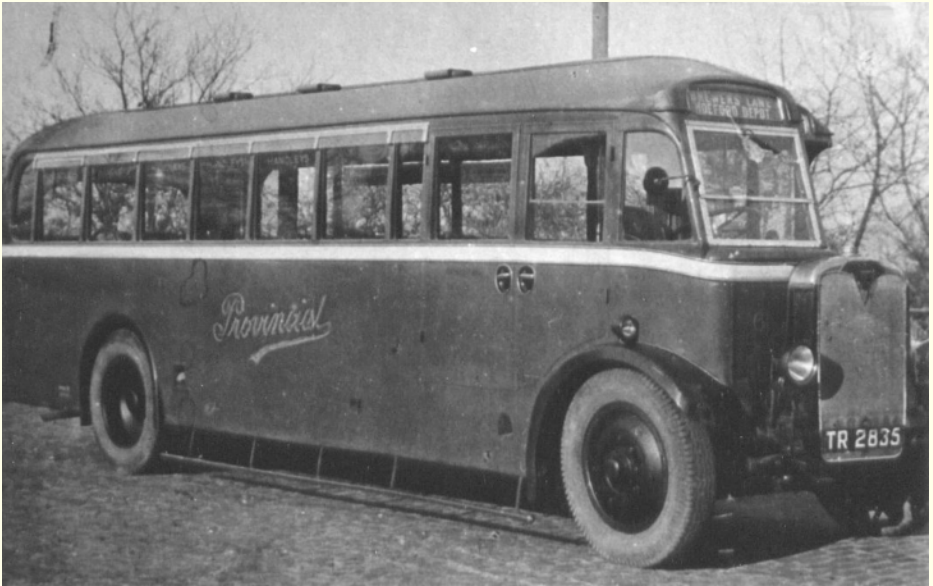
In the late 1930s, Provincial rebuilt the bodywork on some of the former Hants & Dorset Lions to look similar to the AEC Regals which the company operated. Fleet number 6 (TR 2835) is seen here after rebuilding. The earliest withdrawals of these vehicles took place in 1942 and the last withdrawals occurred in 1945.