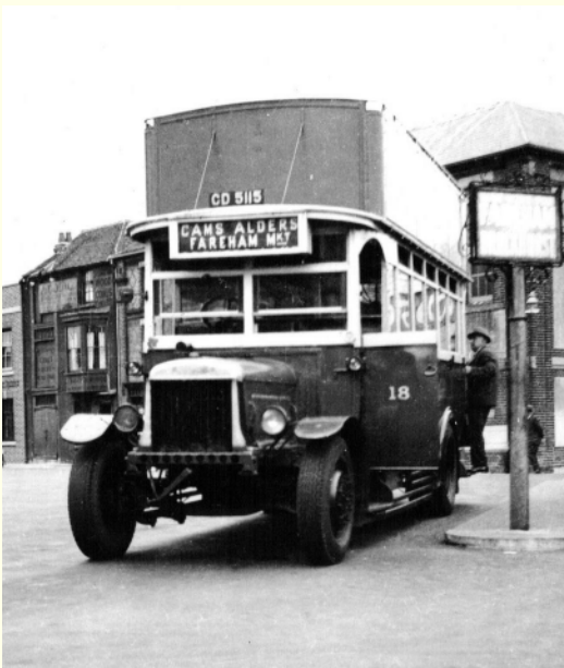
To meet increasing demand, GFOC purchased 6 double deckers from Southdown MS in September 1934, including 18(CD 5115) a 1921 Leyland 'NN' with 1928 Tilling body.