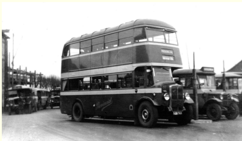
1936 heralded the first new double deckers for the fleet in the form of Park Royal-bodied AEC Regents 34-37 (BOR 766-769). 37 is seen here at Gosport Ferry in its original livery with the cream stripe below the upper deck windows. At least 3 Leyland Lions are also visible in the background.