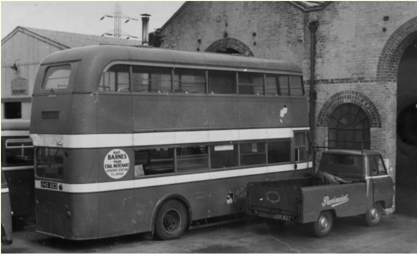
The Ford Thames pickup UOR 827 in company with withdrawn AEC Regent 11 (FHO 603) at Hoeford. This little van was frequently seen around Fareham and Gosport in the 1960s.