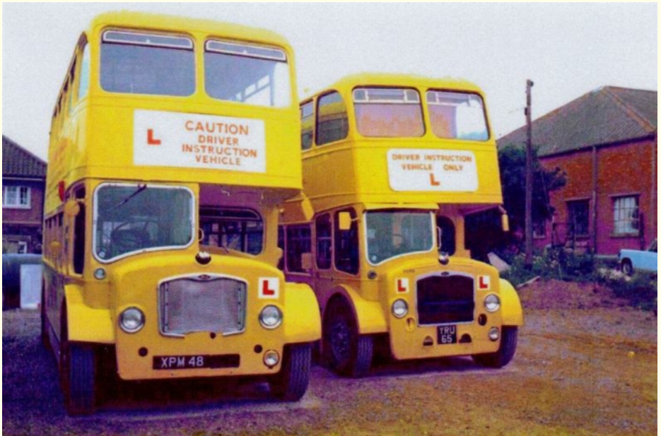
Two of the Hants & Dorset trainers, XPM 48 and YRU 65, together at Hoeford c.1978. XPM 48 was new to Brighton Hove and District.