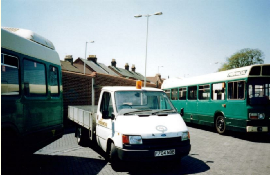
Ford Transit pick-up truck F704 NBB in Fareham Bus Station in the early 1990s.