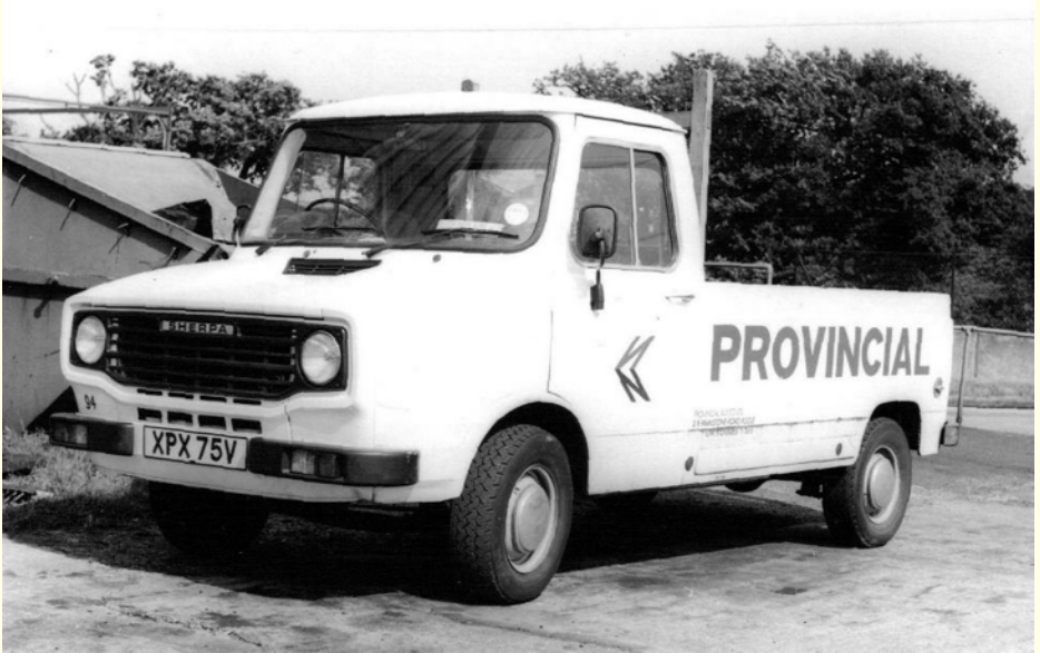
A Leyland Sherpa from the NBC era.