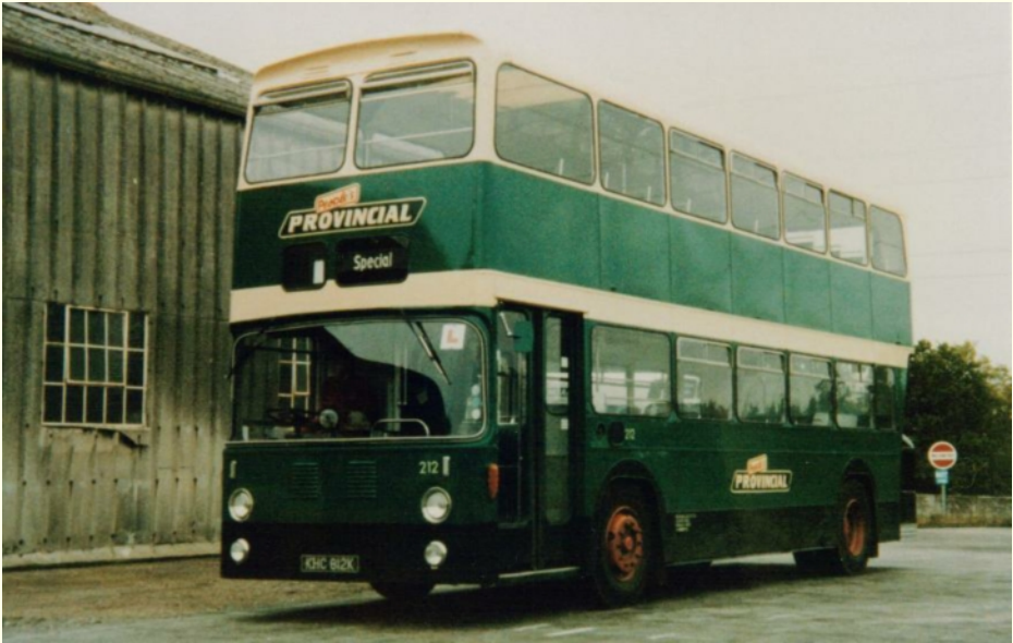
Although ex Southdown 'Queen Mary' 202 (WOW 993T) was the regular training vehicle for People's Provincial, this was sometimes augmented by one of the former Eastbourne Atlanteans as seen here with 212.