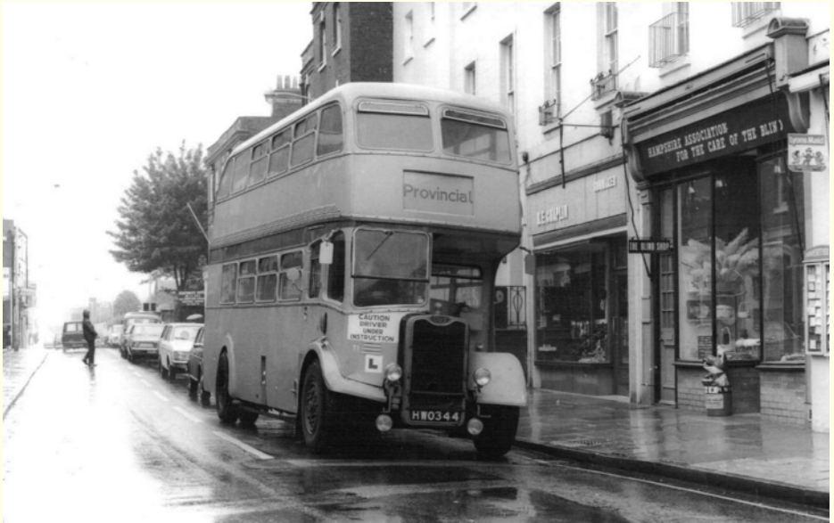
Driver trainer T1 (HWO 344) on a lovely summer's day in Winchester on June 28th 1974.