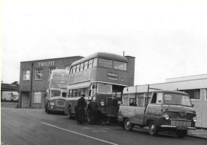
A rare view of UOR 827 'in action' as it comes to the aid of broken down Regent 10 (FHO 602) in the approach road to Fareham BR station c.1967. Behind can be seen a Southdown PD3, the Southdown dormitory shed was just out of shot. The old Twilfit corset factory can also be seen in the background.