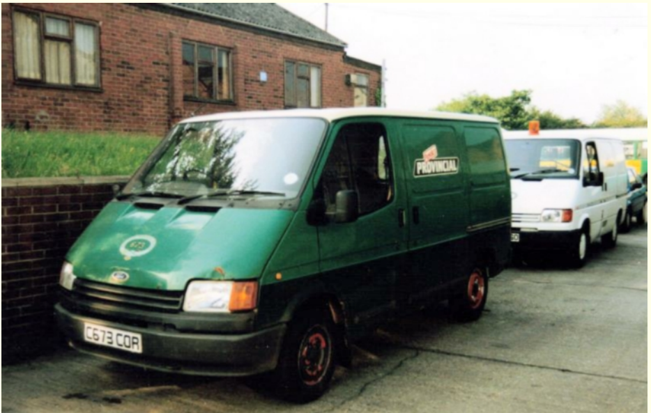
Transit van C673 COR at Hoeford in June 1993.