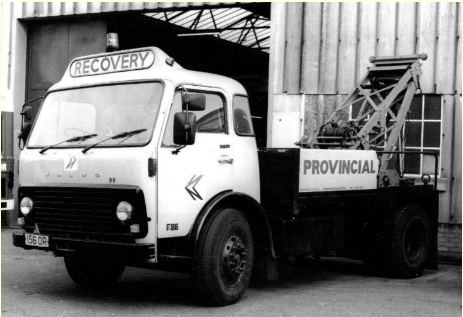
A Volvo F86 recovery vehicle also from NBC days.