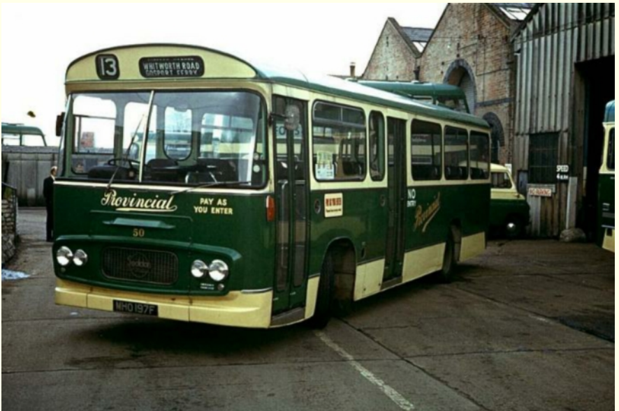
UOR 827s replacement in 1969 was a BMC J2 pickup SOR 192G. Photos of this vehicle have proved elusive, but its nose can be seen peeping from behind Seddon No. 50 (MHO 197F) at Hoeford.