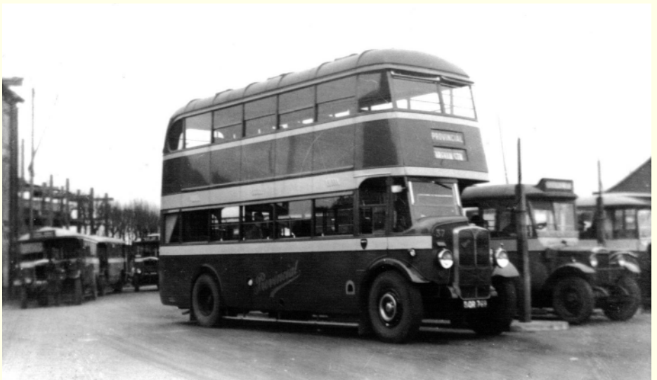
1936 heralded the first new double deckers for the fleet in the form of Park Royal-bodied AEC Regents 34-37 (BOR 766-769). 37 is seen here at Gosport Ferry in its original livery with the cream stripe below the upper deck windows. At least 3 Leyland Lions are also visible in the background.