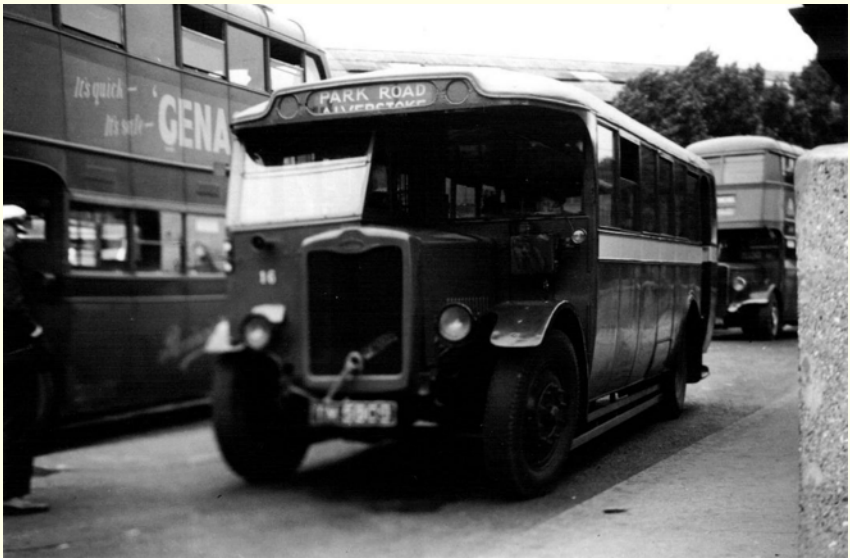
Another Dennis acquired in 1934 was 16(TM 5909), a 1929 'EV' with Strachans bodywork, which remained in service until the early 1950s. After a few years as a stores vehicle at Hoeford, it was damaged beyond repair in the 1957 fire.