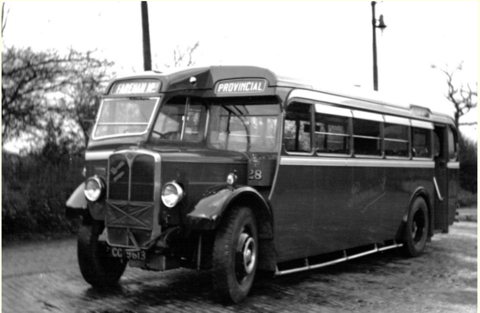
The 8 AEC Regal 4s gave remarkable service to Provincial. No.28(CG 9613), at Hoeford when fairly new, survived until 1968.