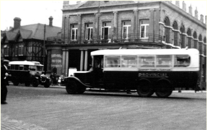
This 1930s view in Gosport High Street captures the spirit of the Provincial fleet of the time, with a 6-wheel Chevrolet about to pass a Thornycroft. Although we haven't been able to positively identify either vehicle, the Thornycroft could well be no.10(TP 6102), which was originally owned by Hawkins of Gosport.