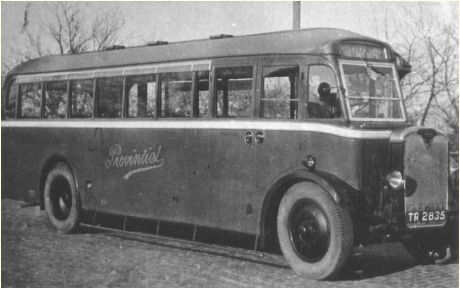
In the late 1930s, Provincial rebuilt the bodywork on some of the former Hants & Dorset Lions to look similar to the AEC Regals which the company operated. Fleet number 6 (TR 2835) is seen here after rebuilding. The earliest withdrawals of these vehicles took place in 1942 and the last withdrawals occurred in 1945.